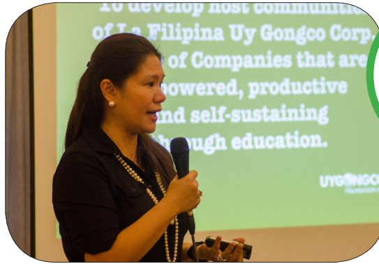
LCF CSR on the Go Caravan: Iloilo