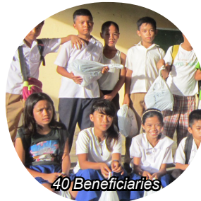
Jordan Central School (JCS) Jordan