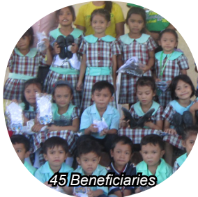
Lapaz II Elementary School (L2ES) Lapaz