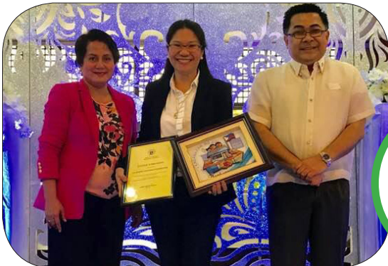
DepEd Partner's Appreciation