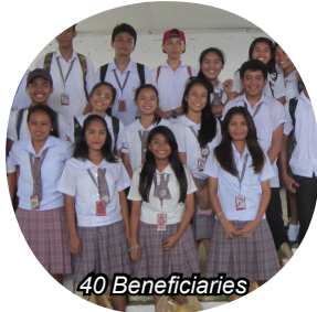
Jalandoni Memorial National High School (JMNHS) Lapuz