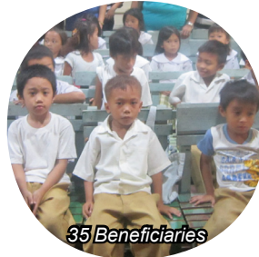
Manuel L. Quezon Elementary School (MLQES) City Proper