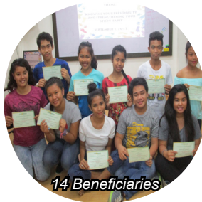
Buntatala National High School (BNHS) Jaro