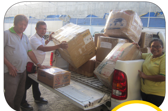
Donating Books for Marawi