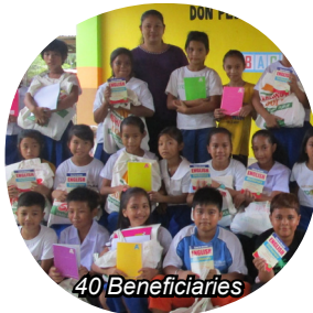
Don Pedro Vasquez Memorial School (DPVMS) Jordan