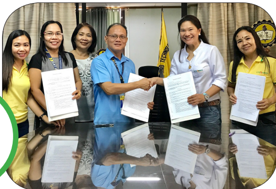
MOA Signing with ISAT-U