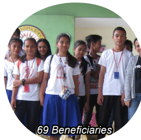
Cabugcabung National High School (CNHS) Pres. Roxas