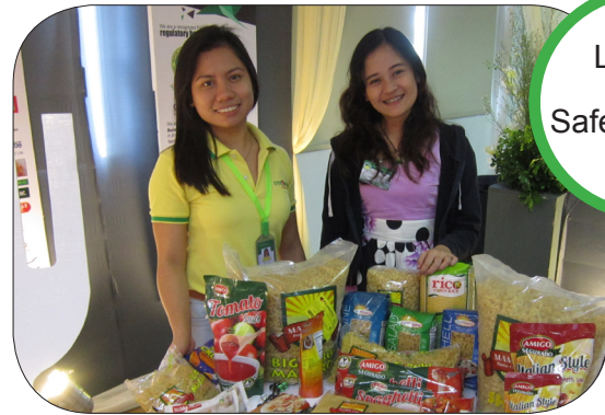
LFUGC Food Safety Exhibit