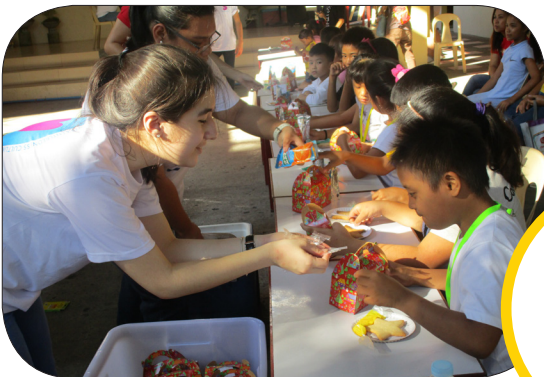
Christmas with the SPED Angels with Ateneo Servire Club