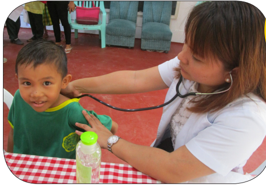
TB Testing of Beneficiaries