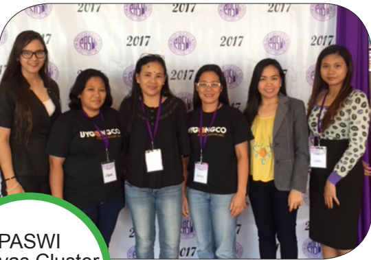
PASWI Visayas Cluster Convention