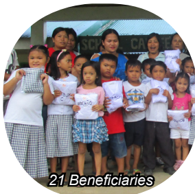
Aranguel Elementary School (AES) Pres. Roxas