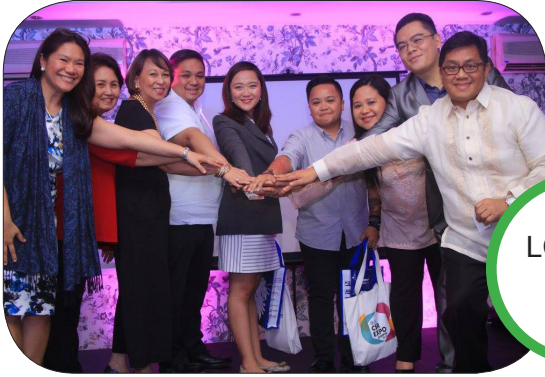
LCF CSR Expo