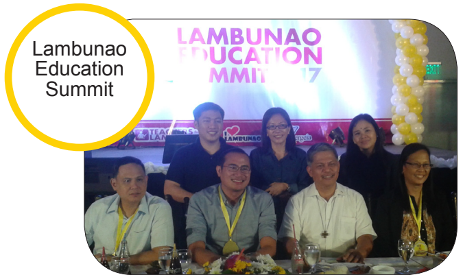
Lambunao Education Summit