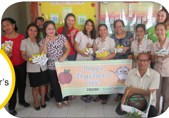
UFI Celebrates World Teacher's Day