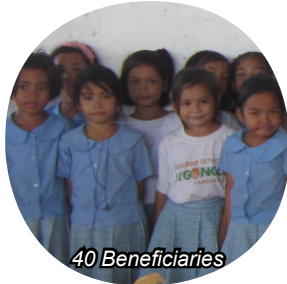
Andres Bonifacio Integrated School (ABIS) City Proper