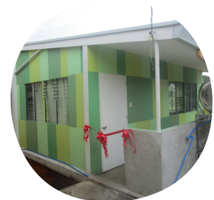
Rizal Elementary School (RES) City Proper