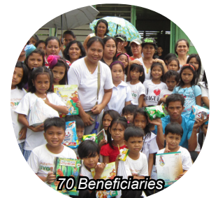
Pres. Roxas East Elementary School (PREES) Pres. Roxas