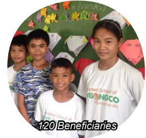
Hibao-an Elementary School (HES) Mandurriao