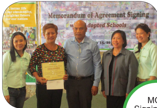
MOA Signing with Adopted Schools