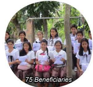
Jordan National High School (JNHS) Jordan