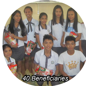
Fort San Pedro National High School (FSPNHS) City Proper