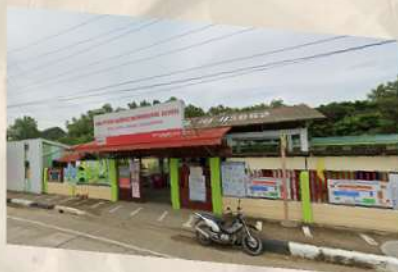
DON PEDRO VASQUEZ MEMORIAL SCHOOL