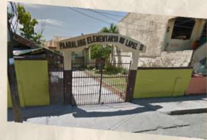
LAPAZ II ELEMENTARY SCHOOL