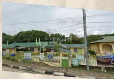
JORDAN CENTRAL SCHOOL