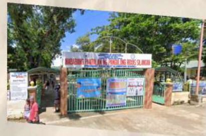
PRES. ROXAS EAST ELEMENTARY SCHOOL