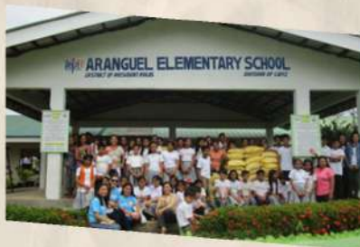
ARANGUEL ELEMENTARY SCHOOL