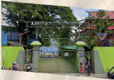
ANDRES BONIFACIO INTEGRATED SCHOOL