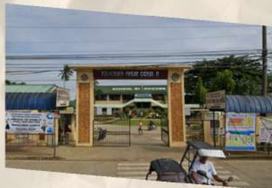
FELICIANO YUSAY CONSING NATIONAL HIGH SCHOOL