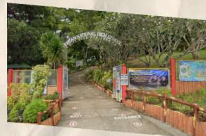
JORDAN NATIONAL HIGH SCHOOL