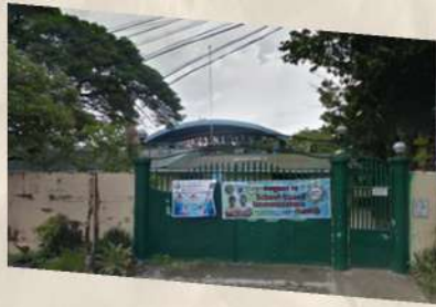
BO. OBRERO NATIONAL HIGH SCHOOL