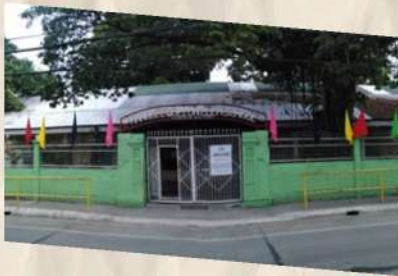
MANUEL L. QUEZON ELEMENTARY SCHOOL