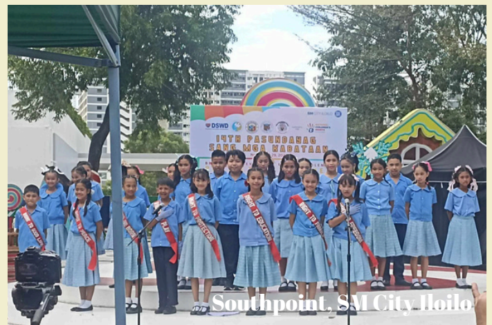
Southpoint, SM City Iloilo