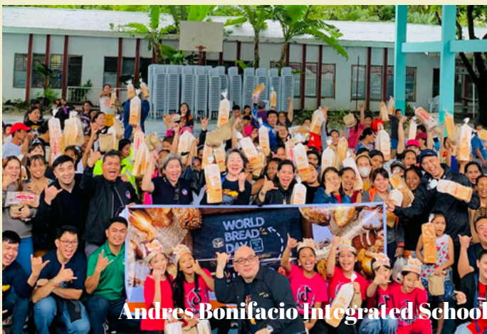
Andres Bonifacio Integrated School