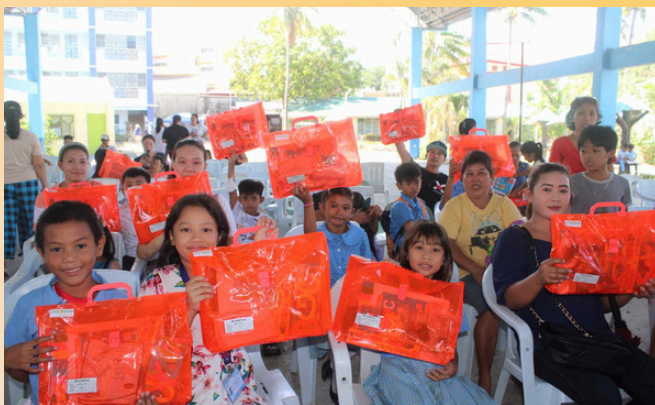
Uygongco Foundation Inc. during the giving of the reinforcement kits at Andres Bonifacio Integrated School. A total of 582 kits were distributed to the adopted schools.