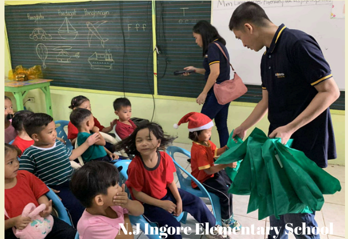
Gift Giving Activity N.J Incore Elementary School