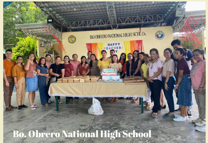
Bo. Obrero National High School