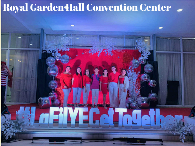
LGUG-GOC Christmas Party