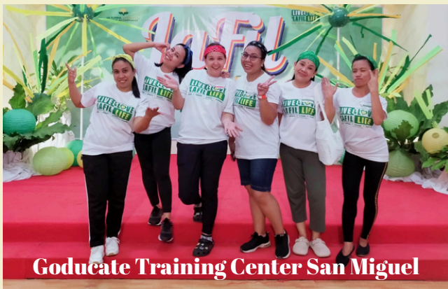
Company Team Building Goducate Training Center San Miguel