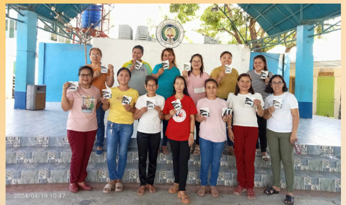
39 teachers of the adopted schools were given a flash drive for them to store their files.