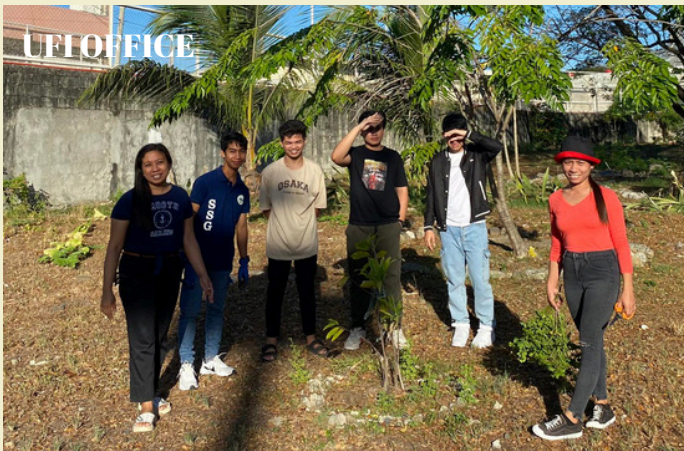
Environmental Activity February 17, 2024, June 08, 2024 August 17, 2024, November 16, 2024