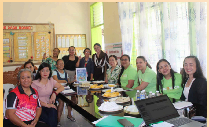
In partnership with ABC+, they were able to donate 20 tablets to Andres Bonifacio Integrated School. In the photo are the teachers of Don Pedro Vasquez Memorial School and UFI staff during their meeting with ABC+.