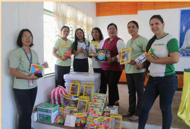
The teachers of the adopted schools of UFI received teaching materials to be utilized for the class. In the photo are the teachers of the Pres. Roxas East Elementary School, together with the UFI staff.

As the Foundation's flagship program. Reinforcement answers the call of the growing issues in education. Within and outside of the classroom, different initiatives were implemented to improve the learning level of the learners in terms of reading, numeracy and science. This is to improve the child's learning level in terms of literacy, numeracy, and science through remedial learning.