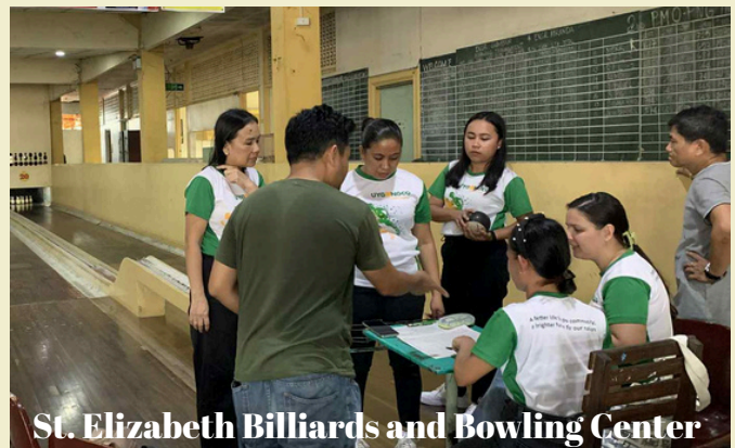
LaFil Sports Fest St. Elizabeth Billiards and Bowling Center